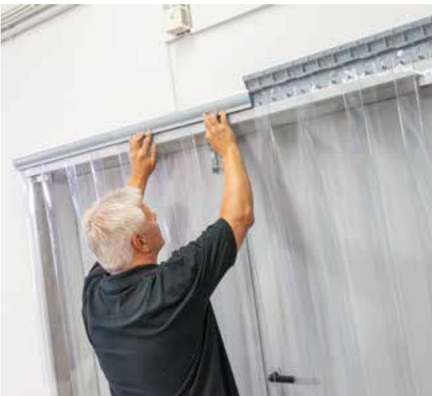
5. Fold the rail shut