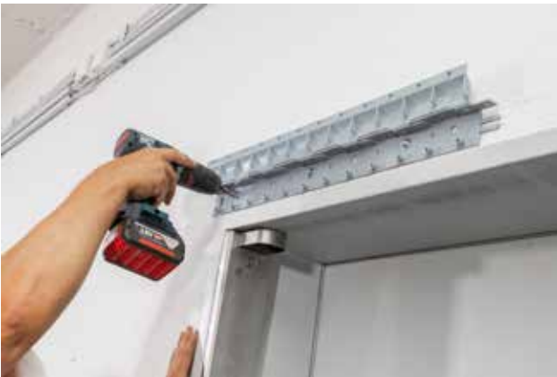
3. Install the rail