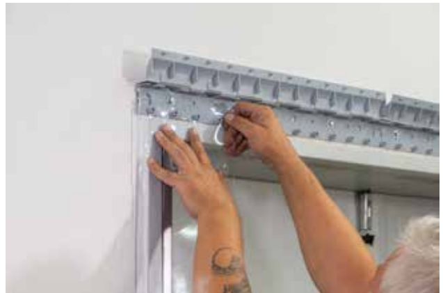
4. Hang the strips in place