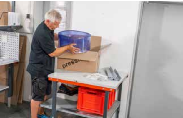
1. Unpack your Pressio.fix