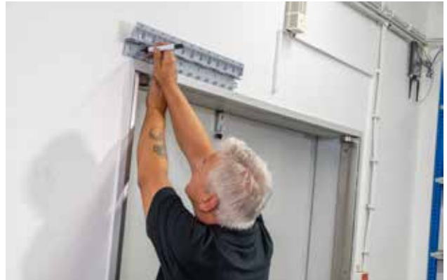
2. Mark and drill the fixing holes